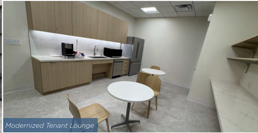
Modernized Tenant Lounge