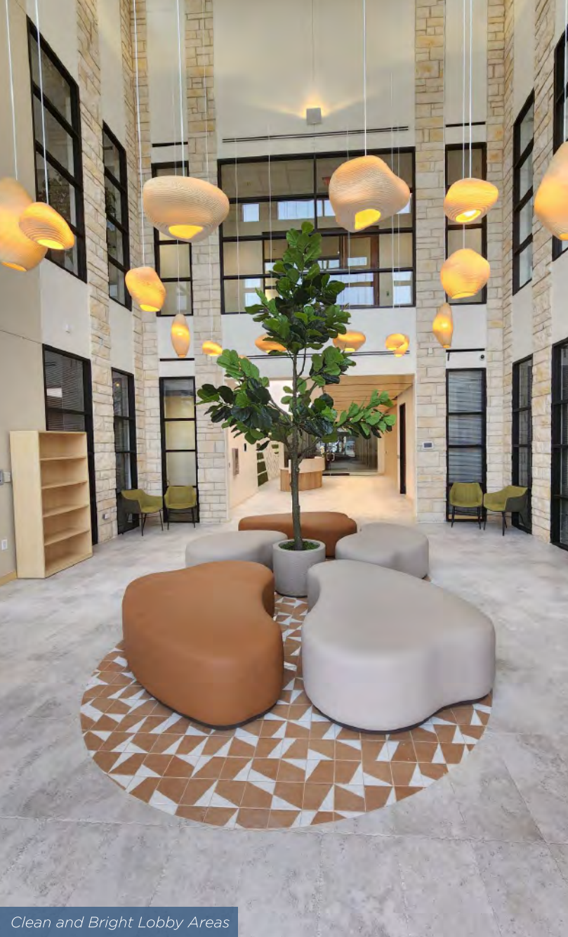
Clean and Bright Lobby Areas