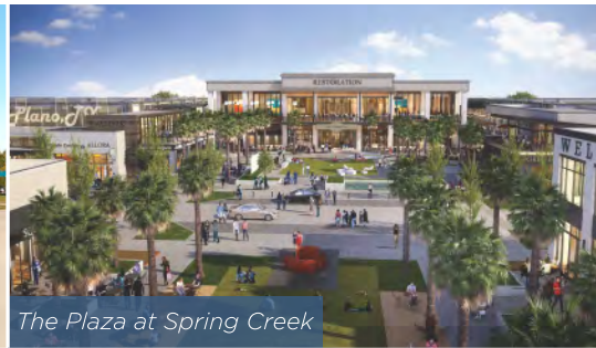
The Plaza at Spring Creek