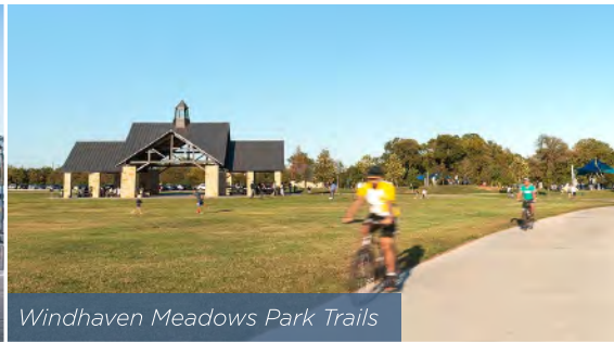
Windhaven Meadows Park Trails