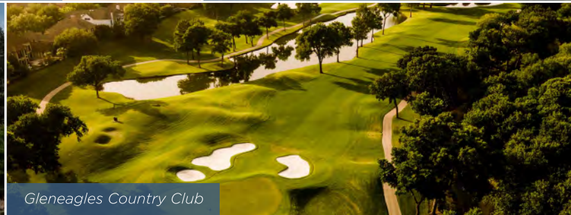
Gleneagles Country Club