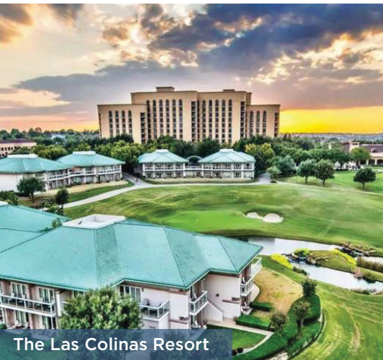
The Las Colinas Resort