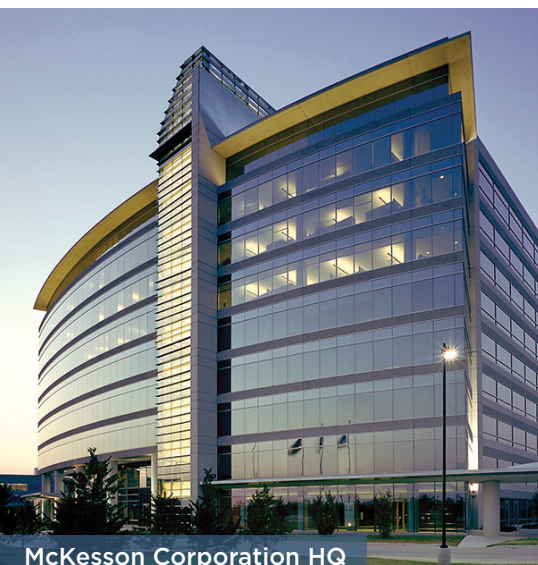
McKesson Corporation HQ

McKesson Corporation | Pioneer Natural Resources | Kimberly-Clark | NEC Corporation | Exxon Mobil | Nokia, Inc. Microsoft | Verizon | CitiGroup | Fluor Corporation | Allstate Insurance | Caterpillar | Celanese