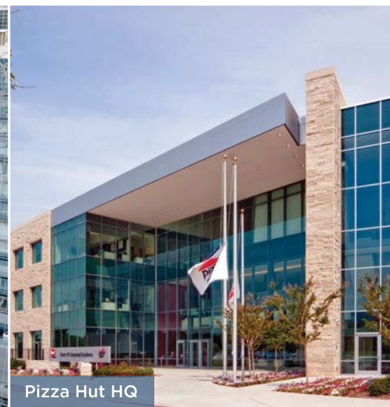
Pizza Hut HQ