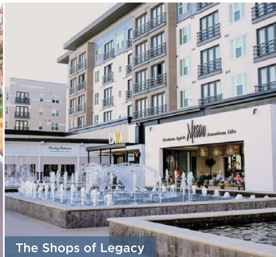
The Shops of Legacy