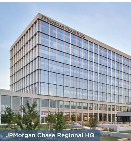
JPMorgan Chase Regional HQ

Bank of America | Ericsson | FedEx Office | Frito-Lay | Hewlett Packard Enterprise | Intuit McAfee | NTT DATA | PepsiCo | JP Morgan | Toyota | Pizza Hut, U.S. | Liberty Mutual