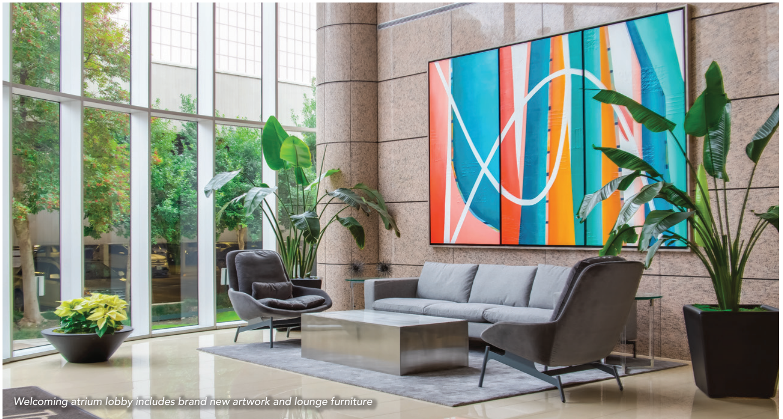
Welcoming atrium lobby includes brand new artwork and lounge furniture