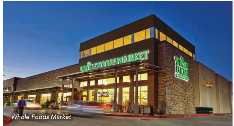
Whole Foods Market