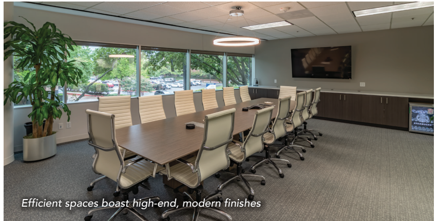
Efficient spaces boast high-end, modern finishes

monument signage opportunities available